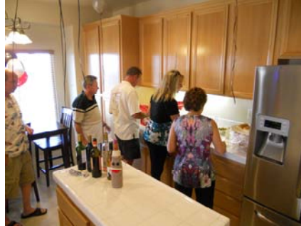
Ham Dinner is Served!