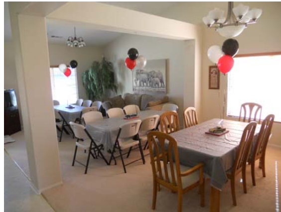
Let the Party Begin!