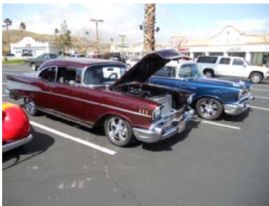
Beautiful... Bruce's '57 in the back!