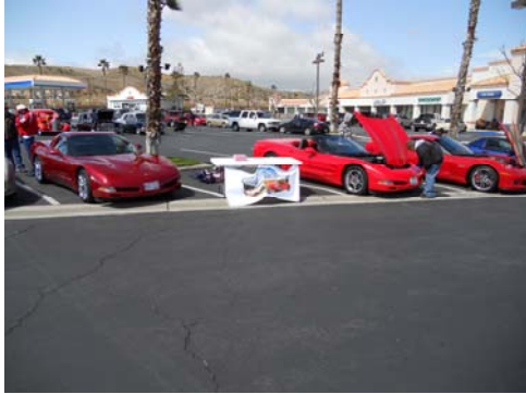
We set up a table with our club banner and handed out flyers to our car show.