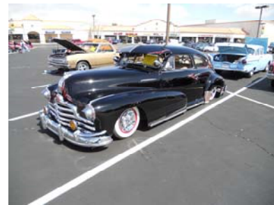
Is this pretty or what?

Several of us from the Antelope Valley Corvette Club, braved the cold weather and wind to join the "Rancho Vista 4th Saturday Cruise-In", held at the Burger King parking lot in Palmdale. There were quite a lot of beautiful classic cars there, including about 7 of our gorgeous Corvettes.