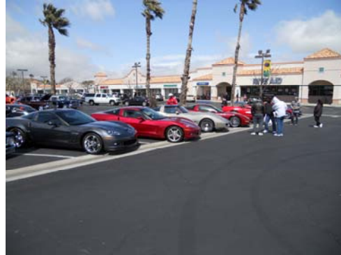
Look at all our pretty Corvettes!