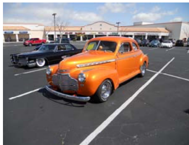
I love this color!