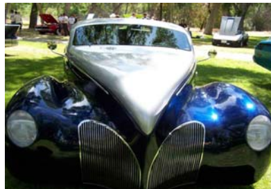
Cool looking Zephyr