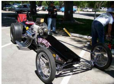
Don Garlits' Top A dragster!